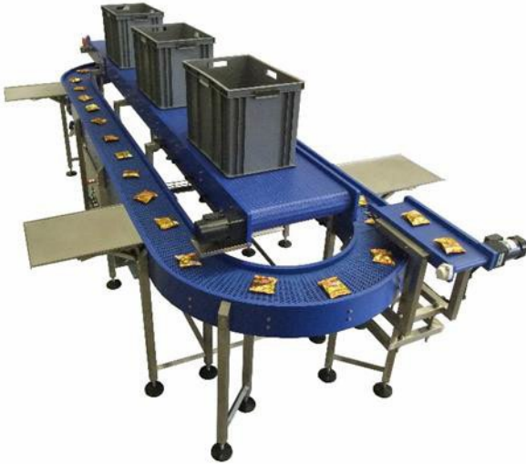
360-DEGREE FLEX LINK BELT CONVEYOR WITH MANUAL PACKING STATIONS