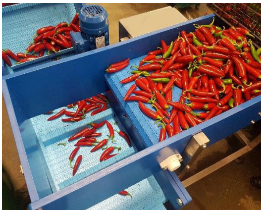
MODULAR LINK BELT TRANSPORTING FROM BULK STORAGE