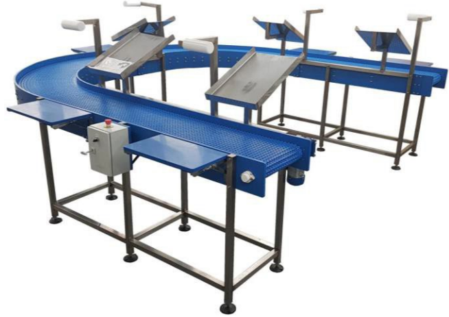
180-DEGREE FLEX LINK BELT CONVEYOR WITH MANUAL PACKING STATIONS