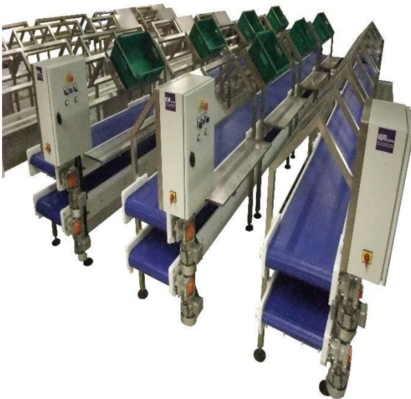
DOUBLE TIER PACKING LINE CONVEYOR