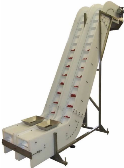
TWIN LANE INCLINE BELT CONVEYORS