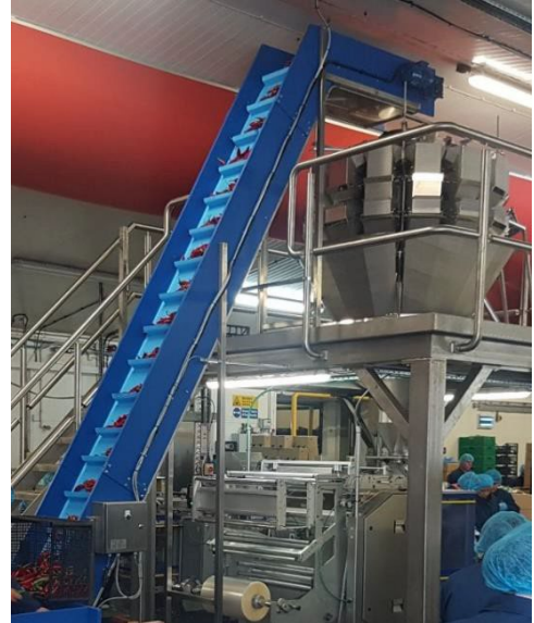
MODULAR LINK BELT SWAN NECK TO A MULTIHEAD WEIGHER