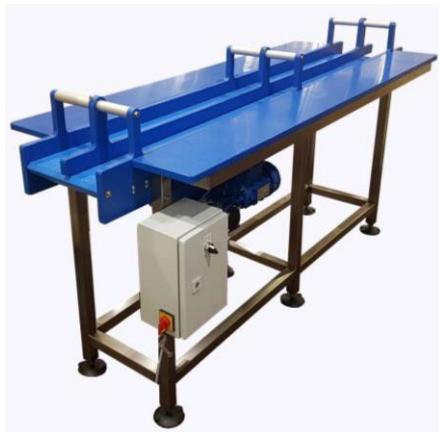
TWIN LANE CONVEYOR WITH MANUAL PACKING STATIONS