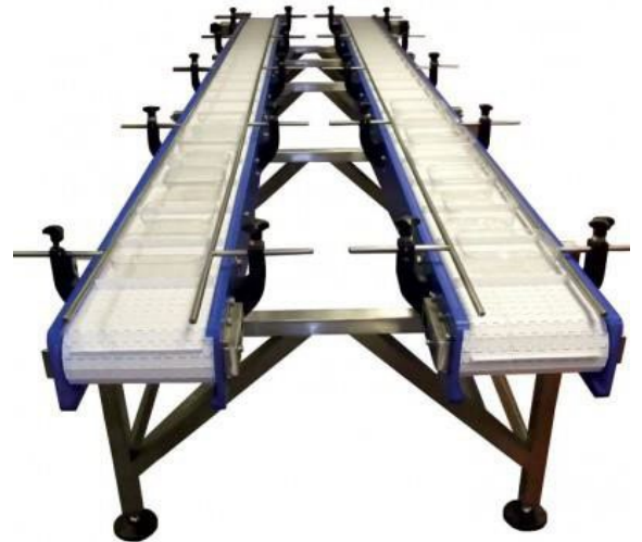
TWIN LANE SOFT FRUIT PUNNET CONVEYOR